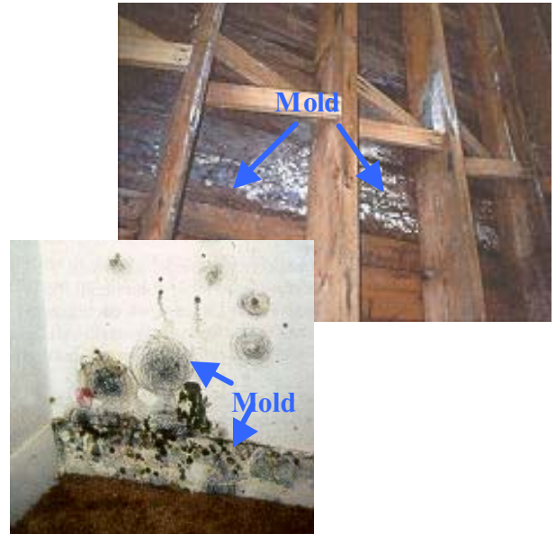
Figure 3. Poor ventilation causes mold growth on the underside of floorboards (top) and in closets (bottom).

Exposure and Location: As with any potential toxicant, the length of exposure time and the amount or concentration of the irritant