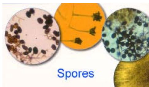
Figure 1. Spores produced on fungi (molds) growing in laboratory petri dishes.

Molds reproduce through microscopic spores (Fig. 1). Spores are moved in water, through the air by breezes, even by a passing person or animal. Several fungi actively discharge spores when environmental conditions are right. Consequently, mold spores are found in indoor and outdoor air. Virtually every breath we take contains mold spores.