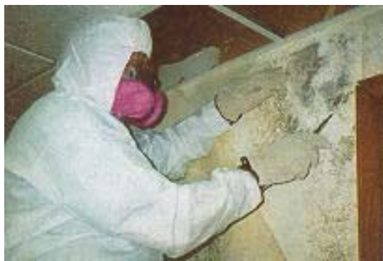
Figure 4. Mold remediation worker wearing personal protective equipment.

Pest inspectors are not required nor are they encouraged to report the presence of a mold as a health-related mold. This is a separate issue. If an inspection for health related molds is needed, it is suggested that a qualified professional be contacted to perform the inspection. Companies who perform inspections and remediation are listed in the yellow pages under “Environmental and Ecological Services” (Fig. 4).